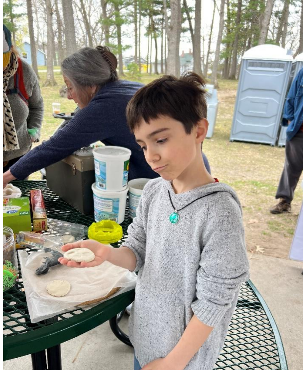
A Pebble Pup outreach program.