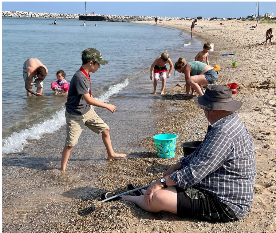
Summer fieldtrip to Van's Beach.