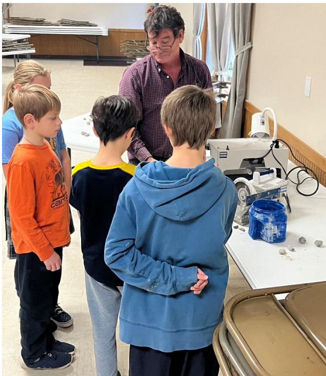
Pebble Pups learning lapidary skills.