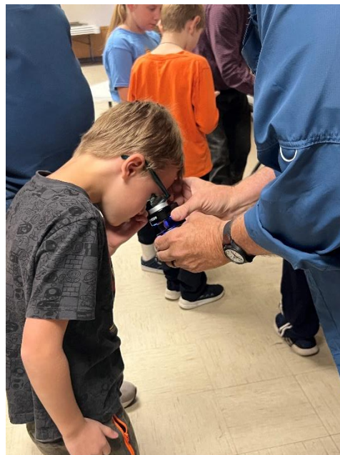
A Pebble Pup takes a closer look at a fossil.

Pebble Pups take an integrated approach to learning. It doesn't merely focus on rock hunting and collecting, but also recognizes the importance of the science behind our hobby. Through a combination of expert tutoring, engaging, and mentorship, young participants are given the tools they need to thrive, both in our hobby and in their classroom.